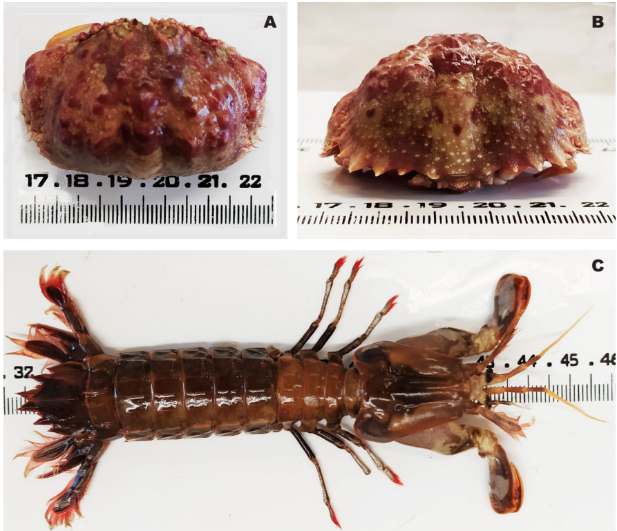
Fig. 2. C. tuerkayana Pastore, 1995: A, dorsal view; B, posterior view of carapace. P. ferussaci (Roux, 1828): C, dorsal view.