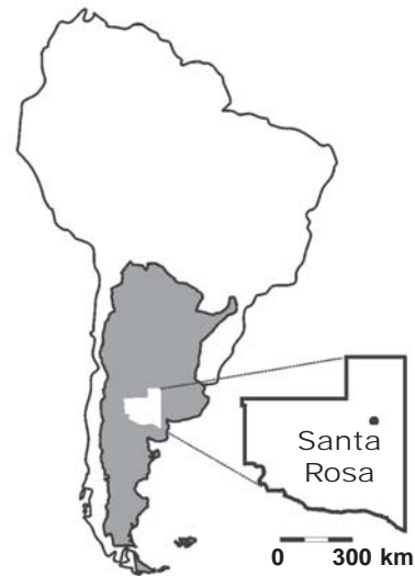
Fig. 1. Map of South America, Argentina and La Pampa indicating the location of Santa Rosa.

Observations: cosmopolitan species, present in 18% of the samples. Egg morphology coincides perfectly with that described for this species. It was absent from samples collected in areas with