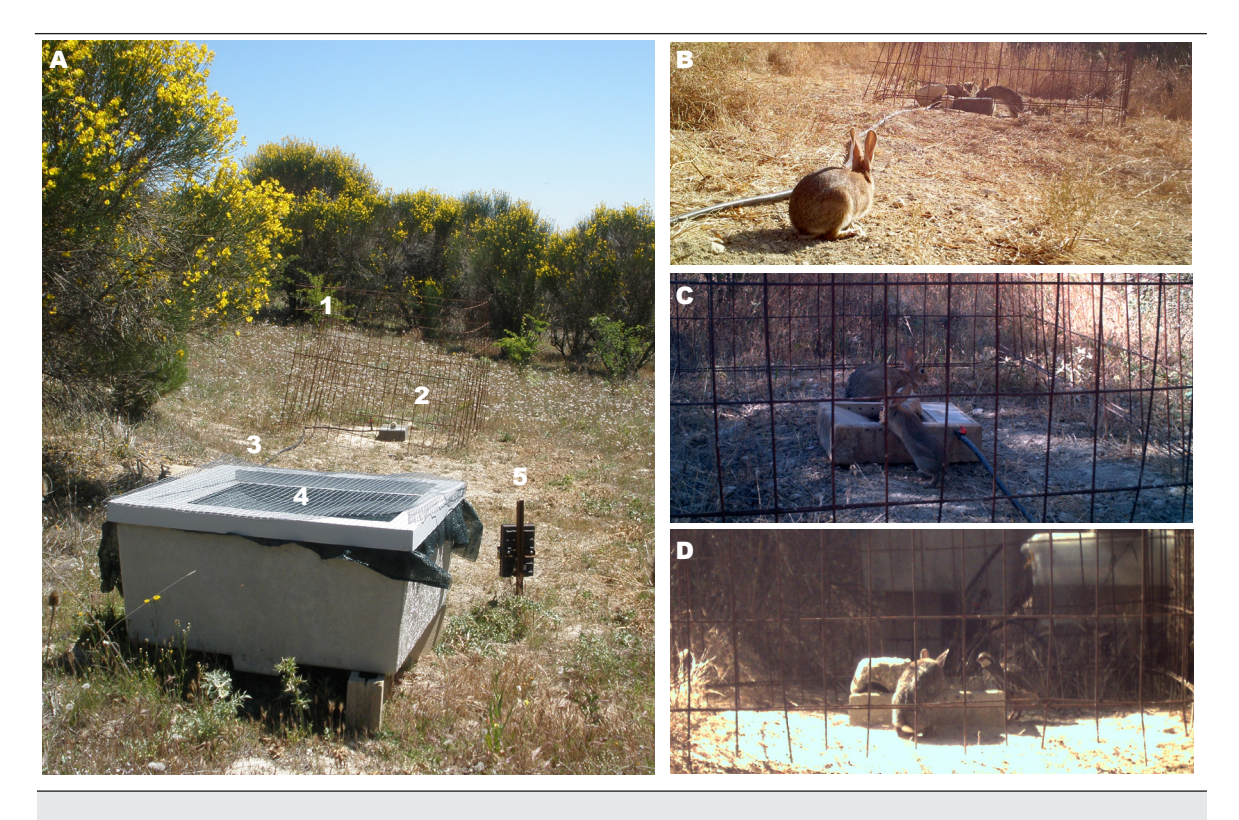
Fig. 1. A. Example of a 'protected' water trough: 1. Metal fence; 2. Trough; 3. Plastic pipe; 4. Water tank; and 5. Camera trap. B. Images of three rabbits drinking at the same time; C. Two drinking rabbits (possibly one juvenile); and D. A rabbit and a red–legged partridge.

Fig. 1. A. Ejemplo de un bebedero con cobertura vegetal: 1. Valla metálica; 2. Bebedero propiamente dicho; 3. Tubería plástica; 4. Depósito de agua; 5. Cámara de fototrampeo. B. Imágenes de tres conejos bebiendo al mismo tiempo; C. Dos conejos bebiendo (posiblemente uno de ellos juvenil); D. Un conejo y una perdiz roja.