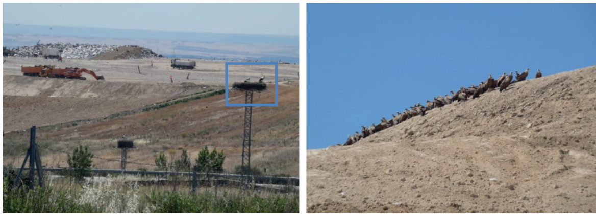
Fig. 2s. Landfill in northern Madrid intensively visited by white storks, black kites, griffon vultures (right panel) and black vultures, what reflects scarcity of carcasses and livestock in the countryside. White storks breed inside the landfill (left panel).

Fig. 2s. Vertedero al norte de Madrid visitado frecuentemente por cigüeñas blancas, milanos negros, buitres leonados (imagen derecha) y buitres negros, lo que refleja la escasez de cadáveres y de ganado en el campo. Las cigüeñas blancas se reproducen dentro del vertedero (imagen izquierda).