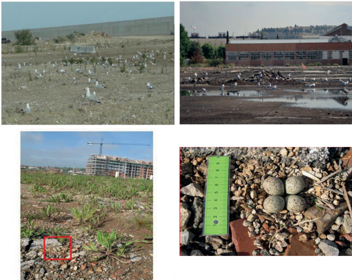
Fig. 1s. Upper panel: Audouin's gull ( Ichthyaetus audouinii ) breeding colonies at a harbour dock under construction in Castellón (E Spain) (left), and in a coastal industrial area in Barcelona city (Zona Franca) (right). In both cases gulls chose a fenced open area close to a fishing port. Lower panel: location of a Little ringed plover ( Charadrius dubius ) nest in an area under urban development (left) and close up of the nest (right). These areas are beneficial for plovers because they have poor vegetation cover.

Fig. 1s. Imágenes superiores: colonias reproductoras de gaviota de Audouin (Ichthyaetus audouinii) en un muelle portuario en construcción en Castellón (España oriental) (izquierda) y en una zona industrial costera de la ciudad de Barcelona (Zona Franca) (derecha). En ambos casos, las gaviotas eligieron una zona despejada vallada cerca de un puerto pesquero. Imágenes inferiores: ubicación de un nido de chorlitejo chico (Charadrius dubius) en una zona en desarrollo urbano (izquierda) y primer plano del nido (derecha). Estas zonas son beneficiosas para los chorlitejos porque tienen poca cubierta vegetal.