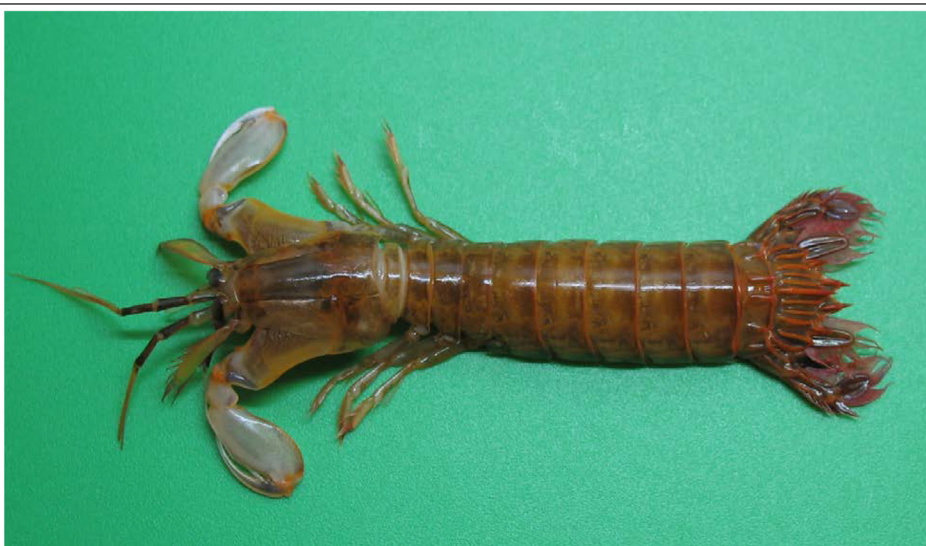
Fig. 2. Pseudosquillaopsis cerisii (BRC code: ICMS000025), male, 18.0 mm CL, dorsal view. Fig. 2. Pseudosquillaopsis cerisii (código BRC: ICMS000025); macho; 18,0 mm CL; vista dorsal.