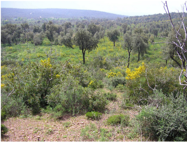
Fig. 2. Matorral dominated by Quercus suber (Original picture, K. Ramdani).

Fig. 2. Matorral con arbres ( Quercus suber ). (Foto original, K. Ramdani).