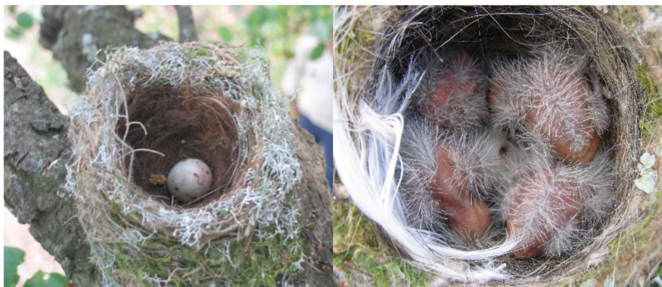
Fig. 3. A, chaffinch nest and egg; B, chaffinch chicks. (Original picture, K. Ramdani).