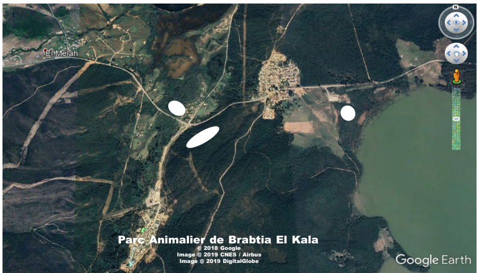
Fig. 1. Location of study stations in El Kala National Park.

Fig. 1. Ubicación de las estaciones de estudio en el Parque Nacional El Kala.