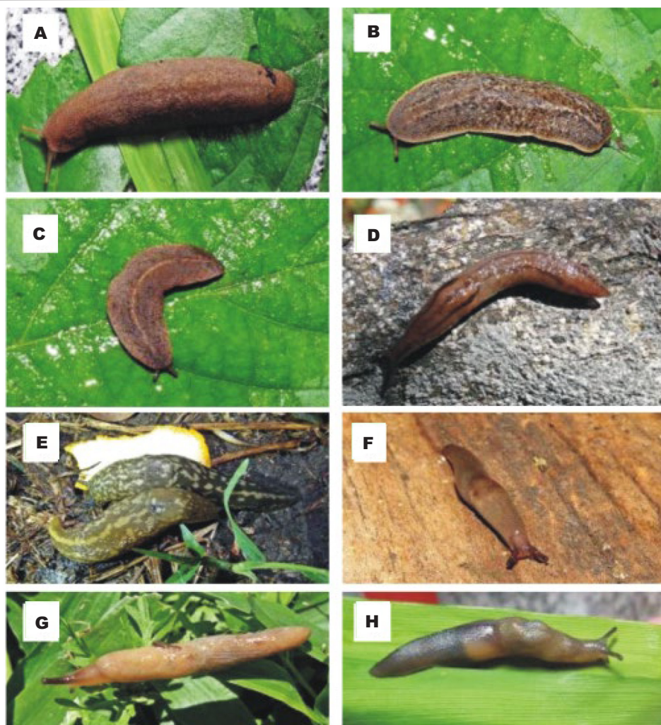
Fig. 2. Slugs recorded: A, Phyllocaulis variegatus ; B, Phyllocaulis soleiformis ; C, Belocaulus angustipes ; D, Ambigolimax valentianus ; E, Limacus flavus ; F, Deroceras laeve ; G, Deroceras reticulatum ; H, Milax gagates .

Fig. 2. Babosas registradas: A, Phyllocaulis variegatus ; B, Phyllocaulis soleiformis ; C, Belocaulus angustipes ; D, Ambigolimax valentianus ; E, Limacus flavus ; F, Deroceras laeve ; G, Deroceras reticulatum ; H, Milax gagates .