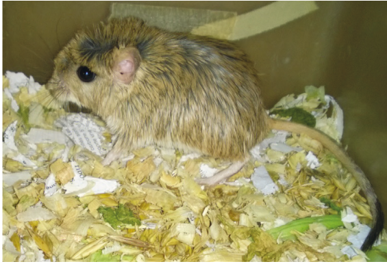
Fig. 2. Young adult male of Meriones crassus (BRF9).

Fig. 2. Ejemplar de macho adulto joven de Meriones crassus capturado (BRF9).