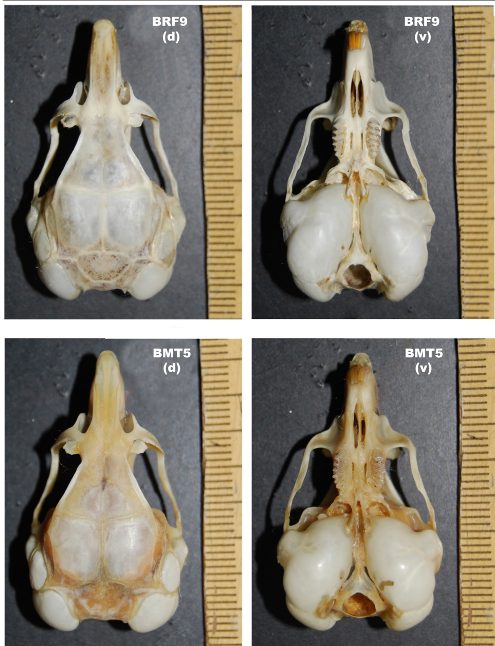
Fig. 3. Skulls of the individuals BRF9 and BMT5 on the dorsal (d) and ventral side (v).