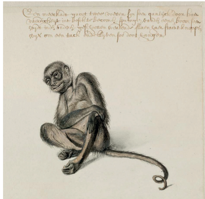
Fig. 4. Franz Post's spider monkey, Ateles sp. EX BK from the Pernambuco Endemism Center, Atlantic forest of northeastern Brazil.

Fig. 4. Mono araña de Frans Post, Ateles sp. (extinto antes de conocerse) del Centro de Endemismo de Pernambuco, bosque atlántico del nordeste del Brasil.