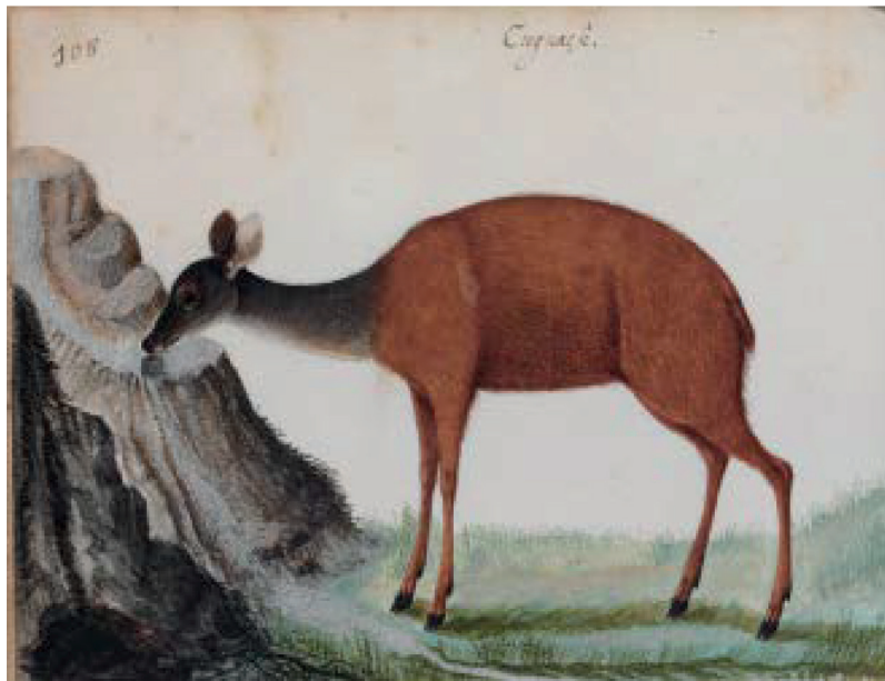
Fig. 2. A species of cf Mazama sp. depicted by Marcgraf (Marcgraf and Piso, 1942) in the CEPE.

Fig. 2. Una especie de Mazama sp. dibujada por Marcgraf (Marcgraf y Piso, 1942) en el CEPE.