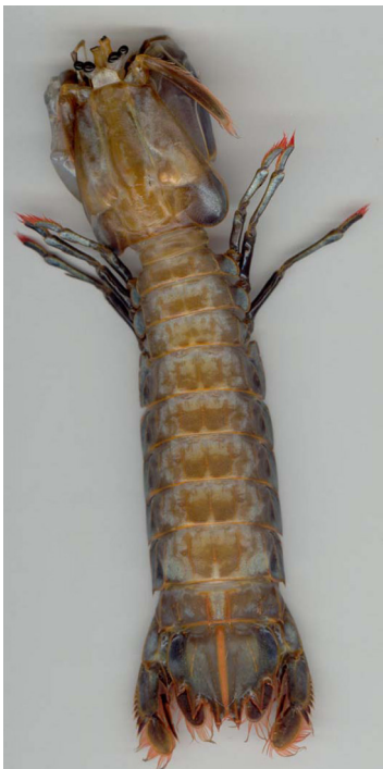
Fig. 2. Parasquilla ferussaci : male from Gavà (Barcelona) (ICMS_94/2007), dorsal view.