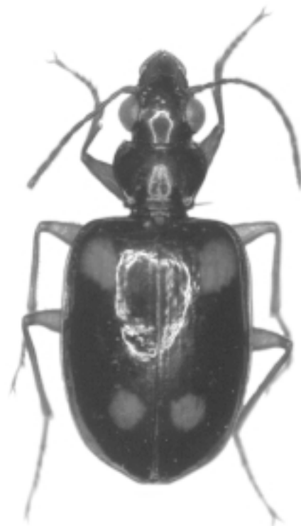
Fig. 2. Habitus of Dolichoctis glabripennis n. sp., length 4.8 mm.

Elytra: rather wide and short, somewhat quadrate, dorsal surface highly convex. Humeri widely rounded, lateral margin gently convex, apical