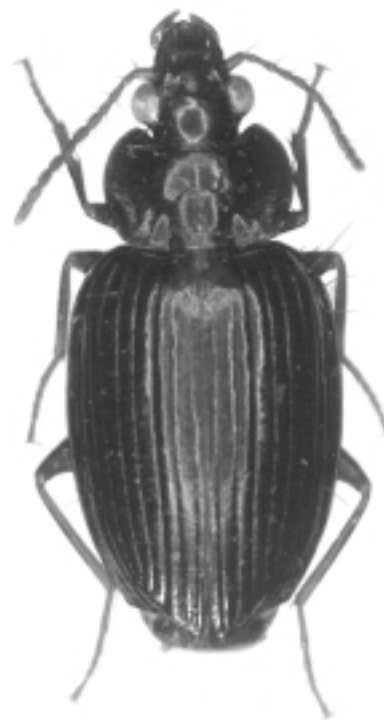
Fig. 6. Habitus de Dolichoctis novaeirlandiae n. sp., length 6.1 mm.

Variation: faint variation noted in relative shape of pronotum and elytra.