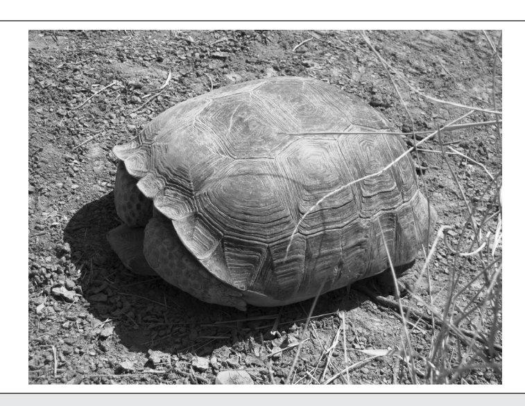
Fig. 1. Bolson tortoise in retracted position. Note the inaccessibility to the blood vessels commonly used to draw blood.

Fig. 1. Tortuga del Bolsón en posición retraída. Nótese la imposibilidad de acceder a los vasos sanguíneos que habitualmente se utilizan para la extracción de sangre.