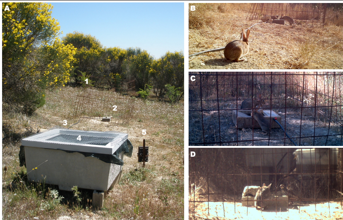
Fig. 1. A. Example of a 'protected' water trough: 1. Metal fence; 2. Trough; 3. Plastic pipe; 4. Water tank; and 5. Camera trap. B. Images of three rabbits drinking at the same time; C. Two drinking rabbits (possibly one juvenile); and D. A rabbit and a red-legged partridge.

Fig. 1. A. Ejemplo de un bebedero con cobertura vegetal: 1. Valla metálica; 2. Bebedero propiamente dicho; 3. Tubería plástica; 4. Depósito de agua; 5. Cámara de fototrampeo. B. Imágenes de tres conejos bebiendo al mismo tiempo; C. Dos conejos bebiendo (posiblemente uno de ellos juvenil); D. Un conejo y una perdiz roja.