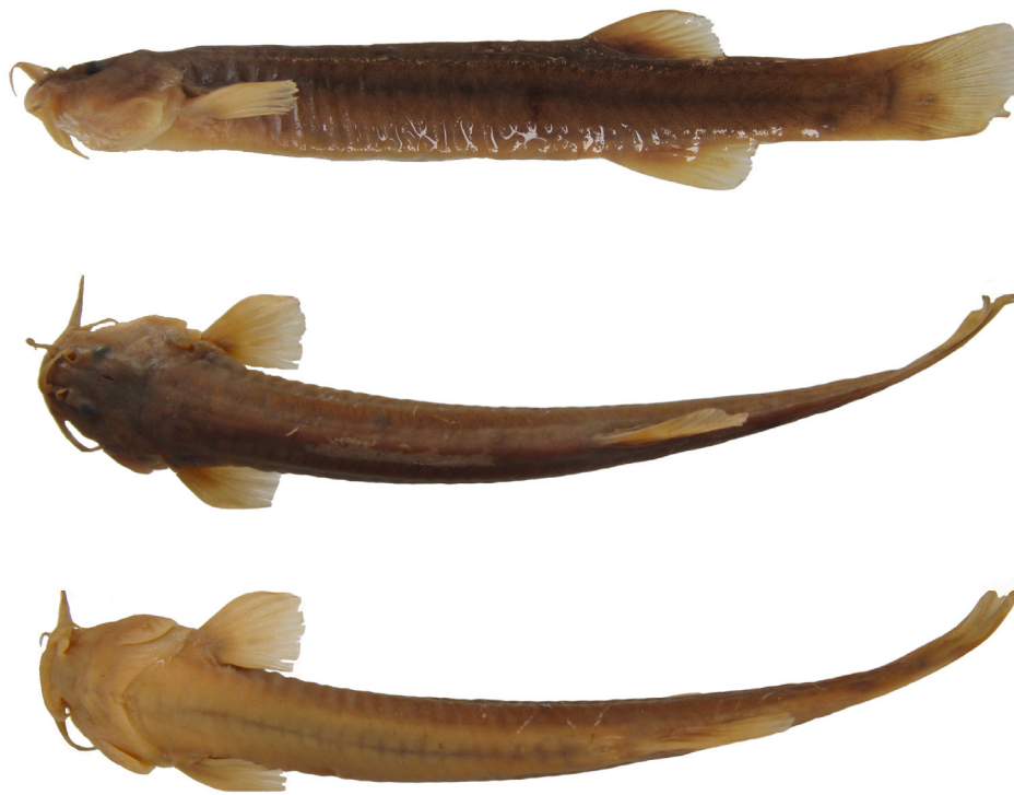
Fig. 1. Silvinichthys pedernalensis n. sp., holotype, FACEN 0071, 45.1 mm SL.