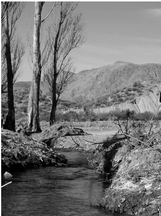
Fig. 3. Type locality of Silvinichthys pedernalensis . Río Pedernal, Sarmiento, Provincia San Juan, Argentina.

Fig. 3. Localidad tipo de Silvinichthys pedernalensis . Río Pedernal, Sarmiento, Provincia de San Juan, Argentina.