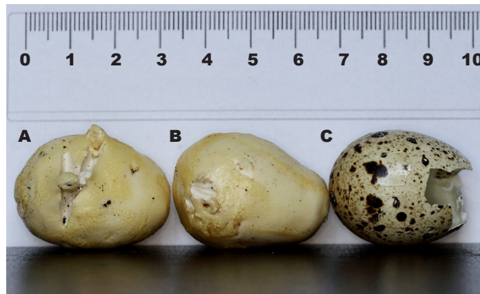
Fig. 2. A. Coated plasticine eggs with bill imprint (pecking) of small-bodied birds; B. Coated plasticine eggs with tooth imprint (gnawing) of small mammals; C. Broken quail egg.

Fig. 2. A. Huevos recubiertos de plastilina con marcas de picotazos de aves de pequeño tamaño; B. Huevos recubiertos de plastilina con marcas de roeduras de pequeños mamíferos; C. Huevo de codorniz roto.