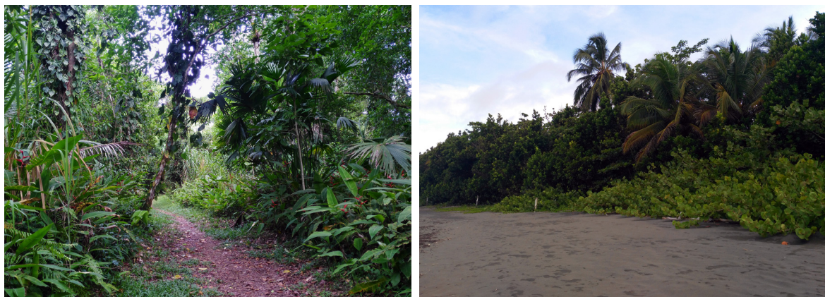
Fig. 1. Views of the two main ecosystems, a) forest and b) beach, used by Holcosus lizards in the study area.

Fig. 1. Vista de los dos principales ecosistemas, a) el bosque y b) la playa, utilizados por los lagartos del género Holcosus en la zona de estudio.