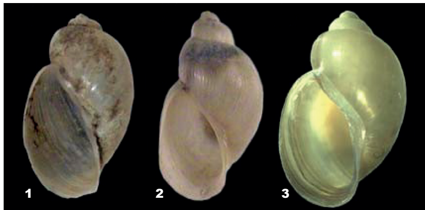
Fig. 1–3. Bulinus truncatus : 1, vegetable garden in Bonanova, Barcelona (Spain) (MNCN 15.05–26320, h = 6.1 mm); 2, Adra (Almería, Spain) (MZB 84–7124, h = 7.9 mm); 3, Porto-Vecchio, Corsica (France) (MVHN–240815AF01, h = 8.0 mm).

Figs. 1–3. Bulinus truncatus : 1, huerto de Bonanova, Barcelona (España) (MNCN 15.05–26320, h = 6,1 mm); 2, Adra, Almería (España) (MZB 84–7124, h = 7,9 mm); 3, Porto Vecchio, Córcega (Francia) (MVHN–240815AF01, h = 8,0 mm).