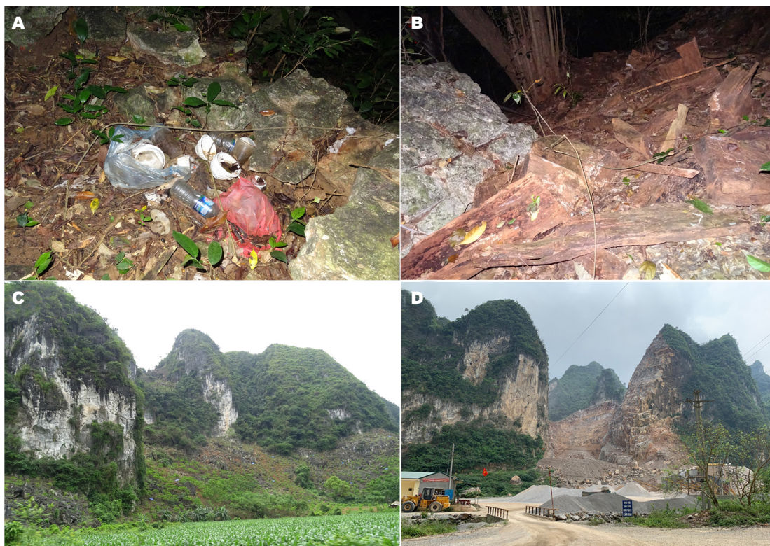
Fig. 3. Anthropogenic impacts in the study area: A, plastic trash; B, timber logging; C, cultivated hill; D, quarrying.

Fig. 3. Efectos antrópicos en la zona del estudio: A, restos de plástico; B, tala de madera; C, colina cultivada; D, cantera.