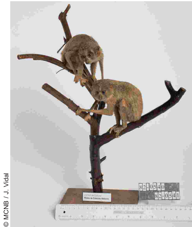
Fig. 3. Loris tardigradus (Linnaeus, 1758): some of the oldest specimens in the collection, collected in Sri Lanka during the expedition to Indochina in 1929.

Fig. 3. Loris tardigradus (Linnaeus, 1758): unos de los especímenes más antiguos de la colección, recolectados en Sri Lanka durante la expedición hacia Indochina en 1929.