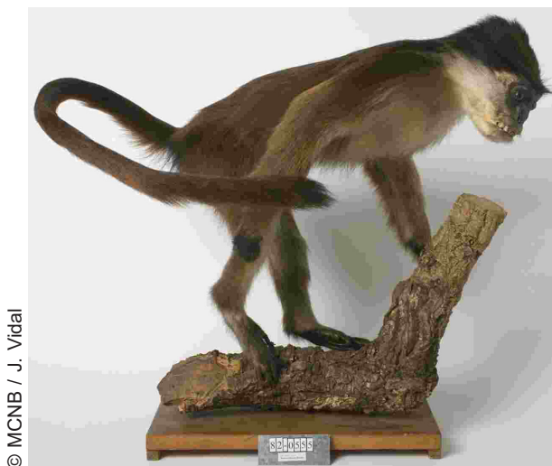
Fig. 8. Ptilocolobus pennantii from Bioko Island. Fig. 8. Ptilocolobus pennantii procedente de la Isla de Bioko.