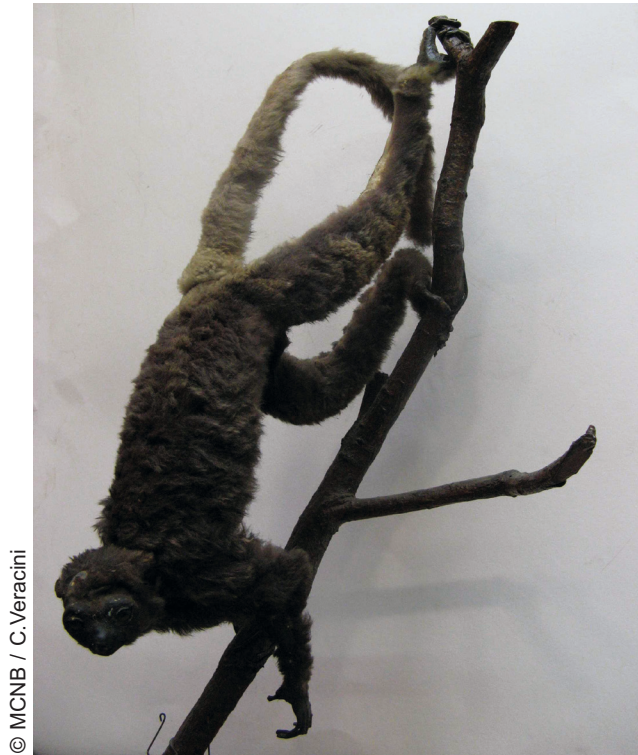
Fig. 6. Specimen of an adult male of Avahi cleesei from Madagascar purchased by the Museum in 1883.