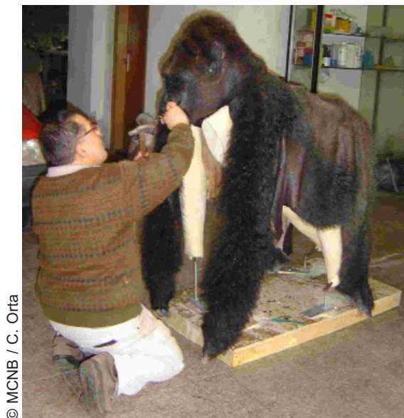
Fig. 4. Preparation of a Gorilla gorilla male received from the Barcelona Zoo.

Fig. 4. Preparación de un macho de Gorilla gorilla procedente del Zoo de Barcelona.