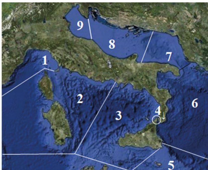
Fig. 2. Subdivision of the biogeographical Italian seas according to Bianchi (2004).

The site IO was the richest (26 species), followed by OR and PF (8), CM (7) and SG (6). The following species were found only at IO: the Canuelloida Longipedia coronata Claus, 1863 (Longipediidae) and the Harpacticoida Arenosetella germanica germanica Kunz, 1937 (Ectinosomatidae), Typhlamphiascus spp., Amphiascopsis sp. 1, Haloschizopera sp. 1 (Miraciidae), Emertonia sp. 1 and 2, Wellsopsyllus intermedius (Scott and Scott, 1895),