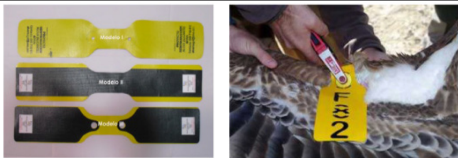
Fig. 3. Models of patagial wing tags. Placement process.

Fig. 3. Modelos de marcas patagiales alares. Proceso de colocación.