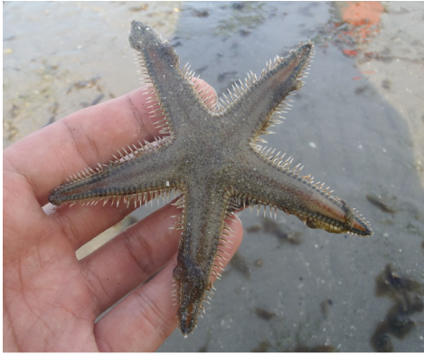
Fig. 8. Astropecten sp. found in Tanjung Adang Shoal.