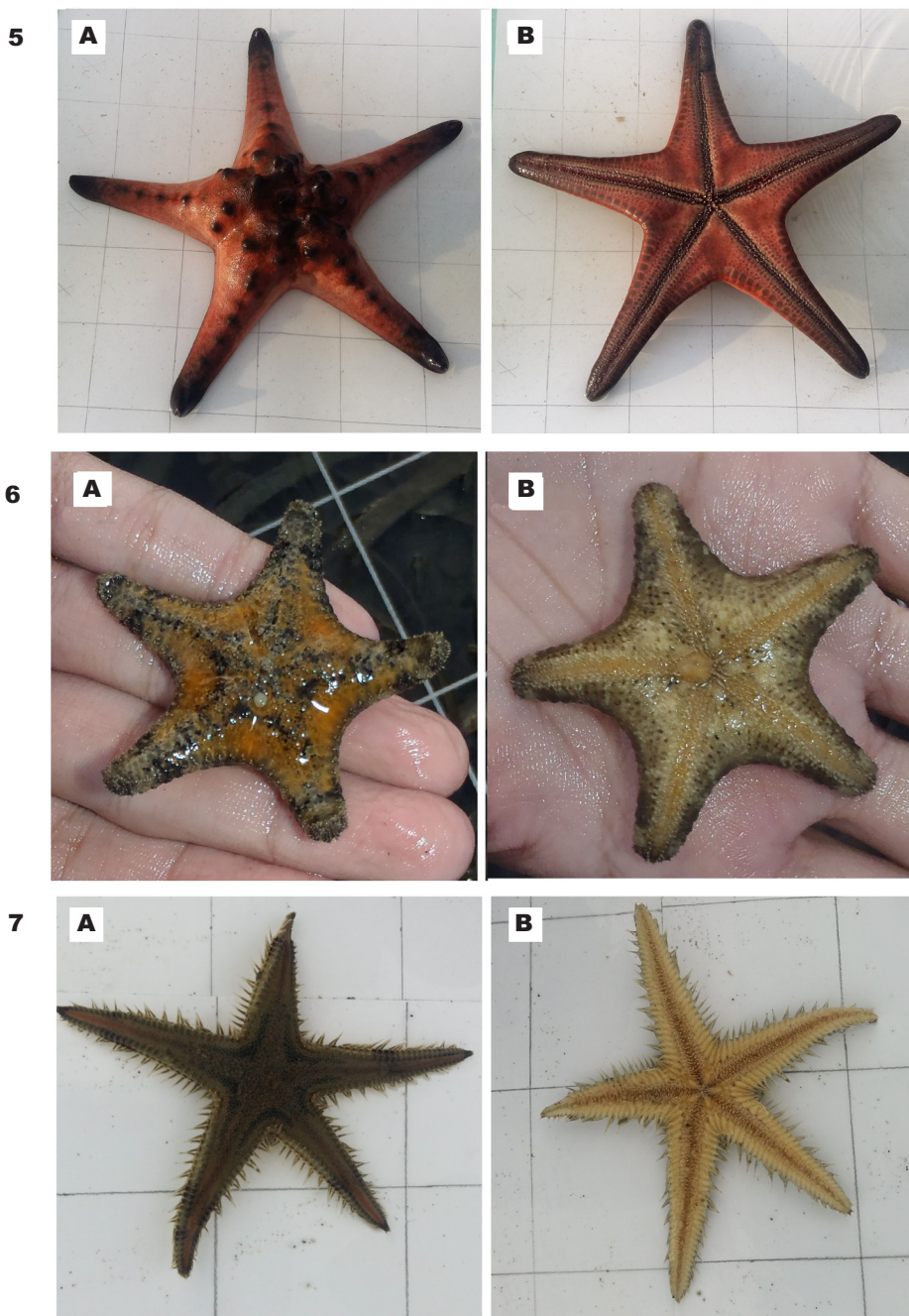
Figs. 5–7. Sea stars sighted in Sungai Pulai Estuary: 5, Protoreaster nodosus ; 6, Anthenea aspera ; 7, Astropecten vappa (A, aboral view; B, oral view).