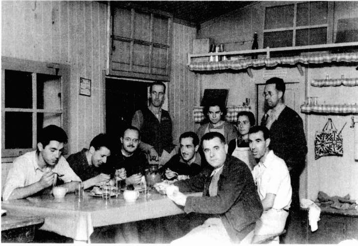
Fig. 2. Rest at the Igaratza shelter, on the biospeleological expedition to the Aralar mountains in August 1945. F. Español is seated at the end on the right. Behind him, standing, J. Elósegui. Seated, from left to right, we can see R. Margalef (second), J. M. Thomas (third) and J. Mateu (fourth).